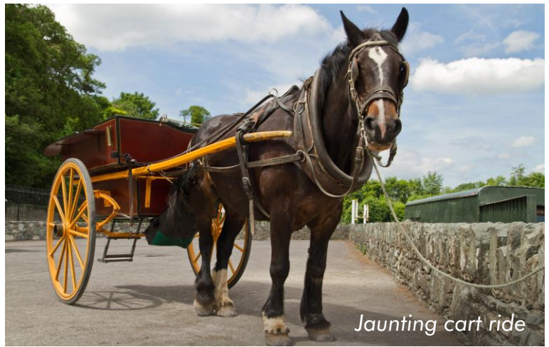
Jaunting cart ride